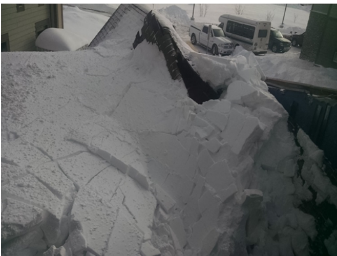
Therapy Roof Collapse

We plan to install a ceiling lift in the therapy department which will make the use of the Alter-G (anti-gravity) therapy machine more efficient to use. Ceiling lifts are also planned for three resident rooms in the heavy care neighborhood. All funds for these two projects were the result of generous giving by individuals, churches, businesses, wills and grants.