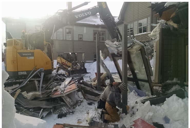
Removal Of The Two Outside Walls