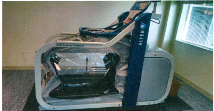
Altra-G Purchased Spring 2016

We are very grateful for the many volunteers who come on Sunday mornings to help with music and transporting residents to the Sunday morning service. There are about 6 pianists who have helped on Sunday morning and about 25 other volunteers who have helped residents get to and from Sunday worship services on a rotating basis.