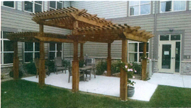
Completed Pergola Spring 2016

With the $10,000 proceeds from our Saint Patrick's Day fund raiser (held at GracePoint Church) we were able to reach our goal of $45,000 for the Alter "G" therapy machine in less than six (6) months. Our goal was reached with a combination of a grant of $2500 from Capital Electric, a gift from an estate, individual donors and a staff fund raiser. We received a $10,000 grant from the Frank Wedge Trust earlier this summer. This will be used in part to fund our music & memory program and support our nurse education/loan re-payment program.